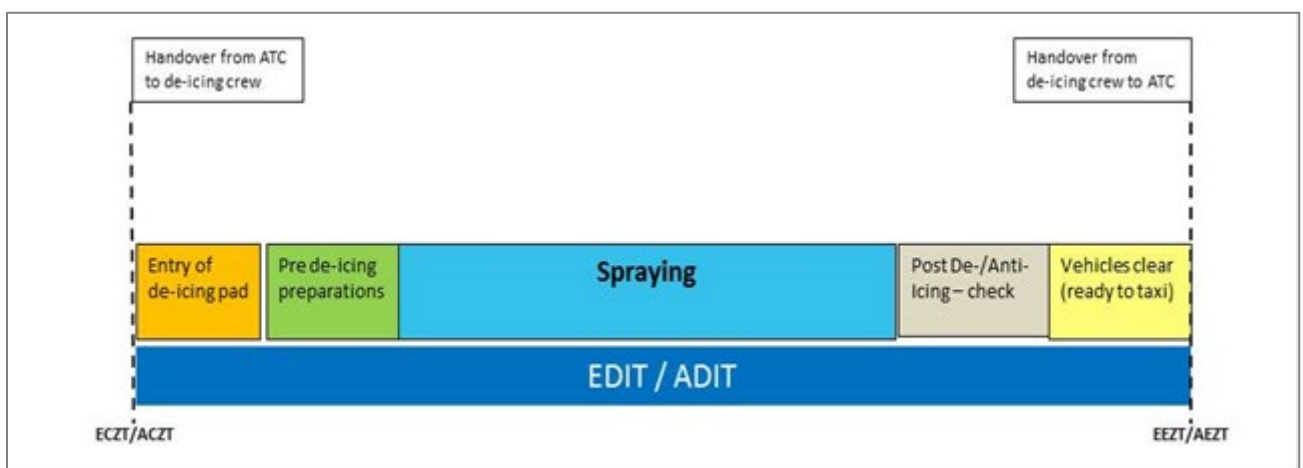
Figure 3: Diagram of de-icing team (EDIT / ADIT)

The following figure shows the definition of the Estimated Duration of De-icing Time (EDIT) and Actual Duration of De-icing Time (ADIT). The DFS transmits the actual commencement (ACZT) and end time (AEZT) for the de-icing process.